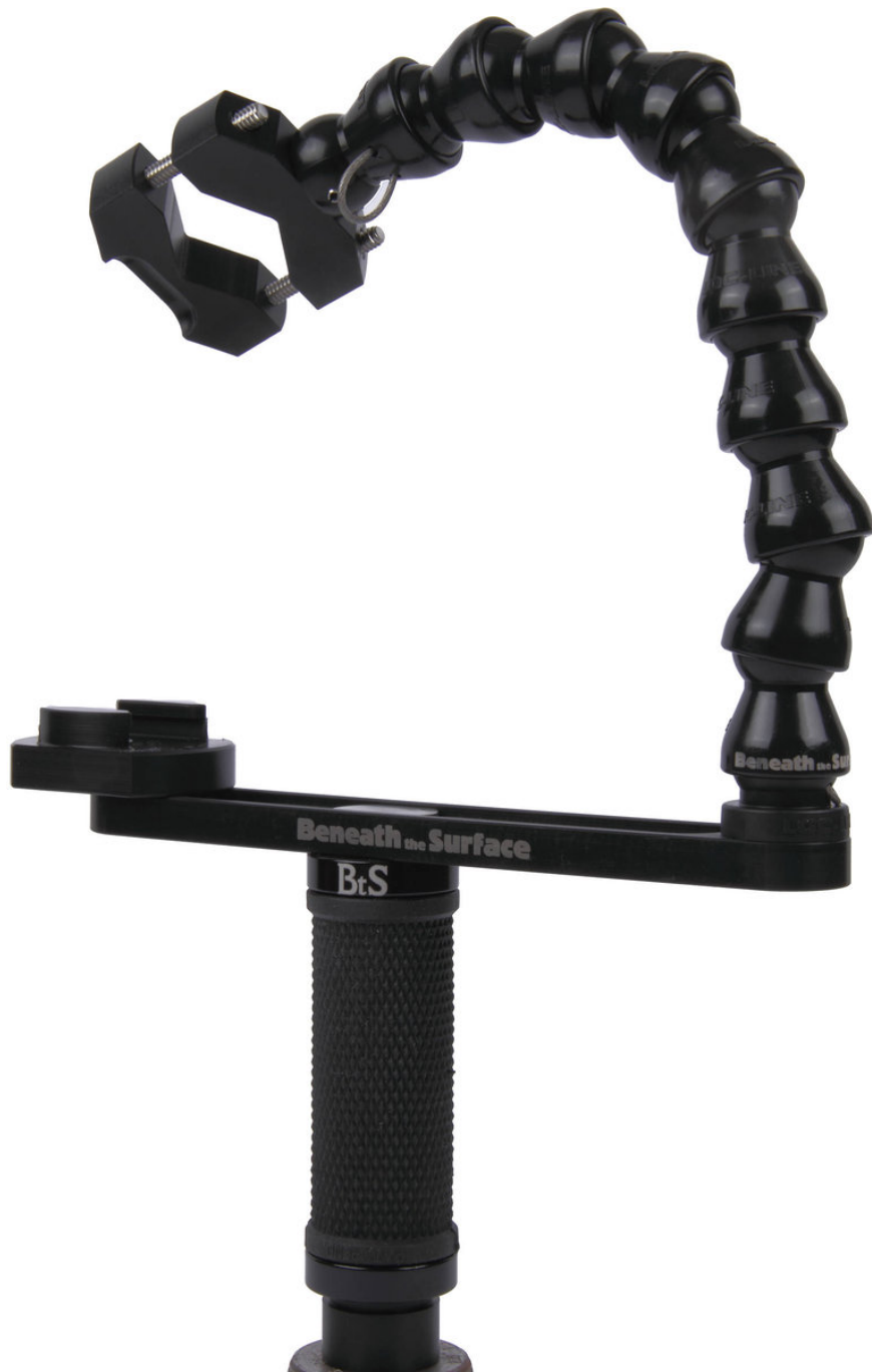
Flexi Sign Pro 10 Rar